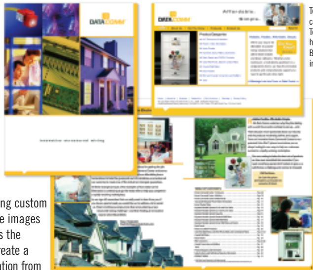
Top left: Catalog cover Top right: website homepage Bottom: catalog inside spread

Visit us at www.greatdesignthatworks.com or call us at 770.493.7154 to find out how we can help you improve your image!