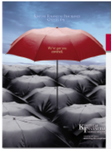
Left: Front cover of presentation folder Below: Front of two-sided corporate capabilities sheet

Visit us at www.designthatworks.com or call us at 770.493.7154 to find out how we can help you improve your image! And stay tuned for the next installment of Design That Works!