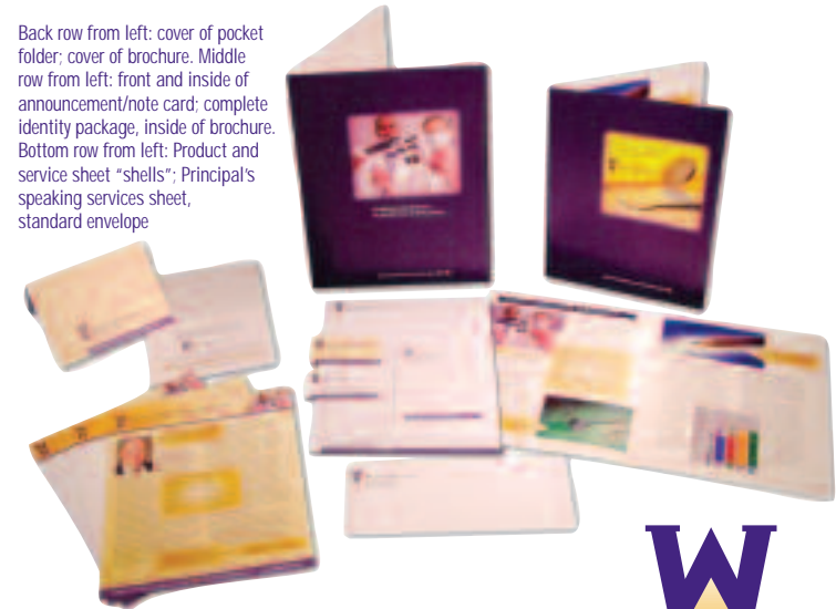
Back row from left: cover of pocket folder; cover of brochure. Middle row from left: front and inside of announcement/note card; complete identity package, inside of brochure. Bottom row from left: Product and service sheet “shells”; Principal’s speaking services sheet, standard envelope

Visit us at www.greatdesignthatworks.com or call us at 770.493.7154 to find out how we can help your business!